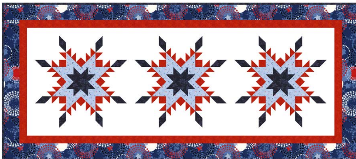
Table runner: 20" x 46"