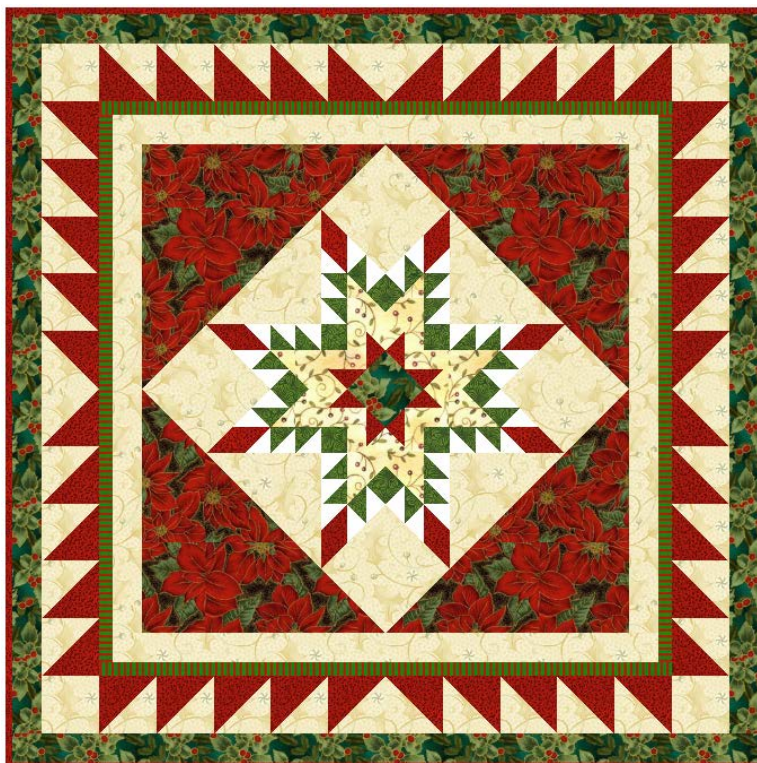
Christmas table topper Finished size: 26" x 26"