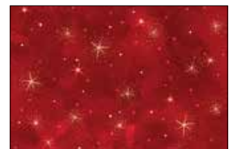
MMNT 531 R