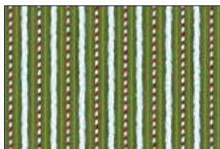
MMNT 530 G