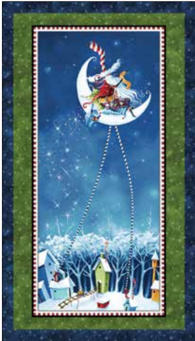
MMNT 525 PA – shown selvage to selvage – 24" repeat

Metallic Accent Collection by Paper D'Art