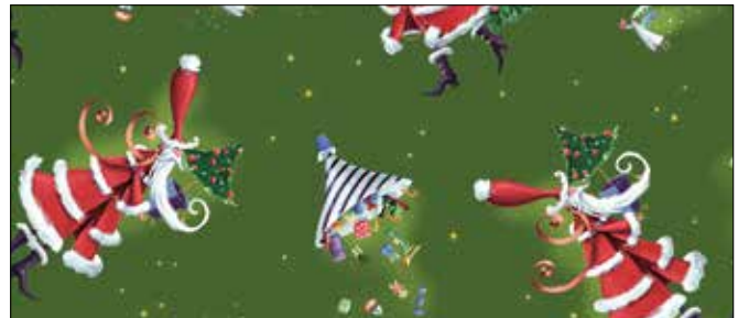
MMNT 527 G