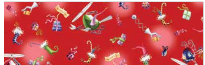
MMNT 529 R