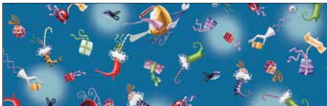
MMNT 529 B