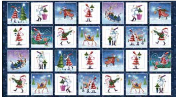
MMNT 526 MU – shown selvage to selvage – 24" repeat – 5 1/2" blocks