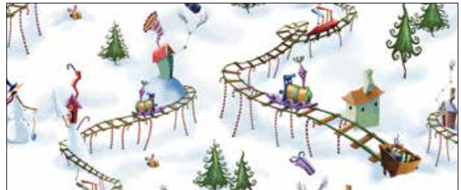
MMNT 528 W