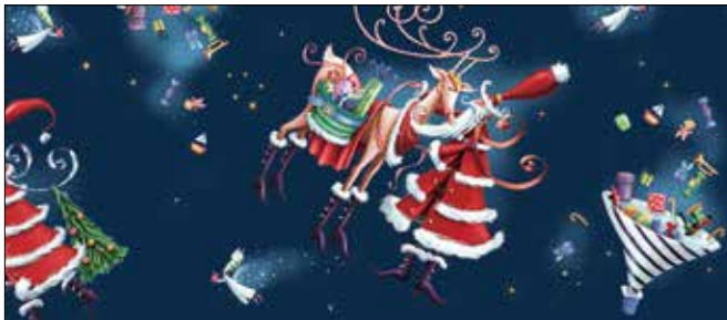
MMNT 527 N