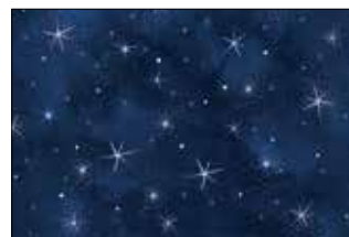
MMNT 531 N