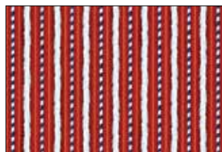
MMNT 530 R