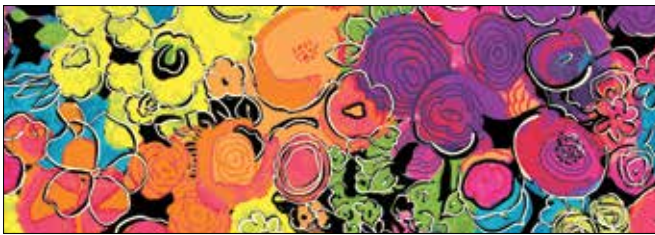
VERA 226 K