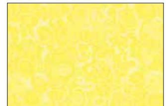
VERA 231 Y