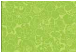
VERA 231 G