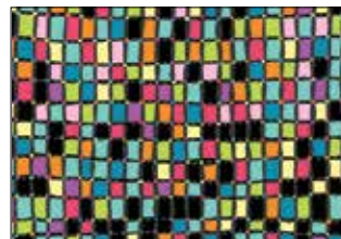
VERA 230 K