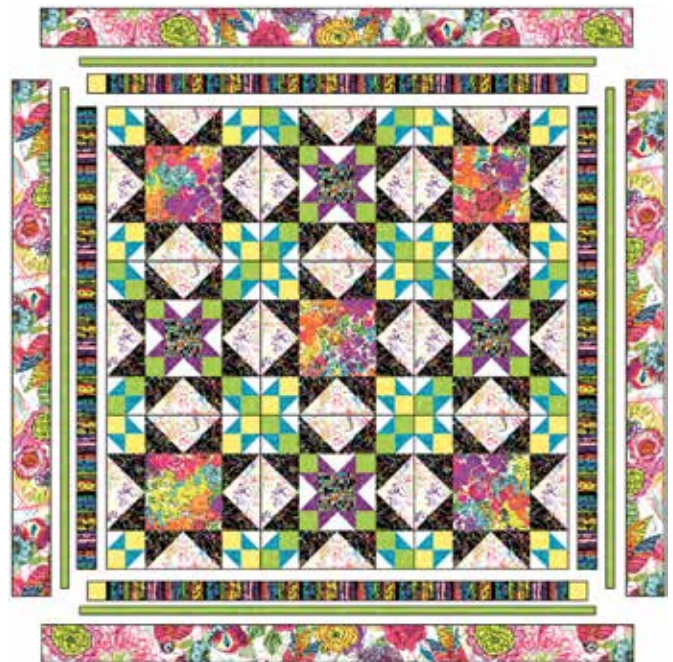
Quilt Layout Diagram

13. Layer the quilt top with batting and backing; baste. Quilt as desired. Using the fabric E 2\frac{1}{4} "-wide binding strips, bind the edges to finish.