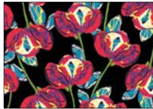
VERA 228 K