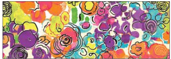
VERA 226 W