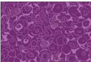
VERA 231 C