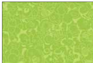
VERA 231 G