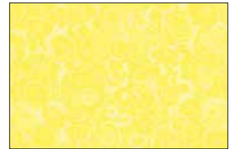
VERA 231 Y