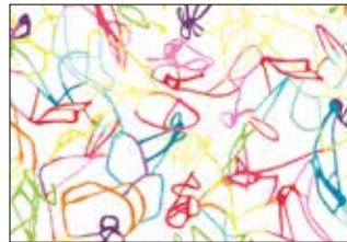
VERA 227 W