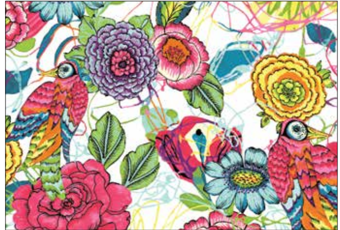
VERA 225 W