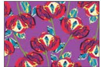
VERA 228 C