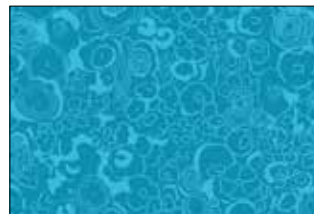
VERA 231 T