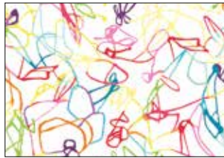
VERA 227 W