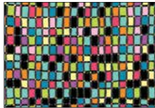
VERA 230 K