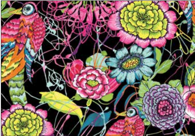
VERA 225 K