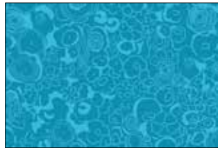
VERA 231 T