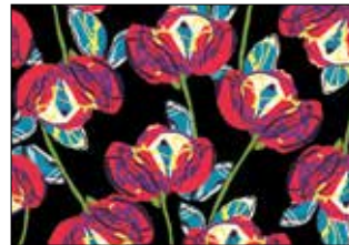
VERA 228 K