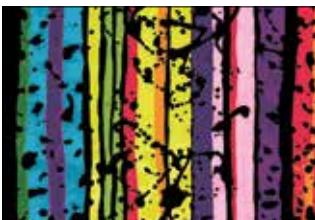
VERA 229 K