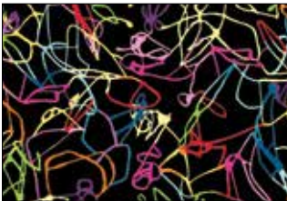
VERA 227 K