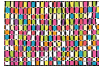
VERA 230 W