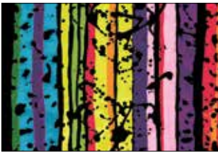
VERA 229 K