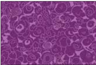
VERA 231 C