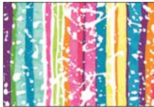
VERA 229 W